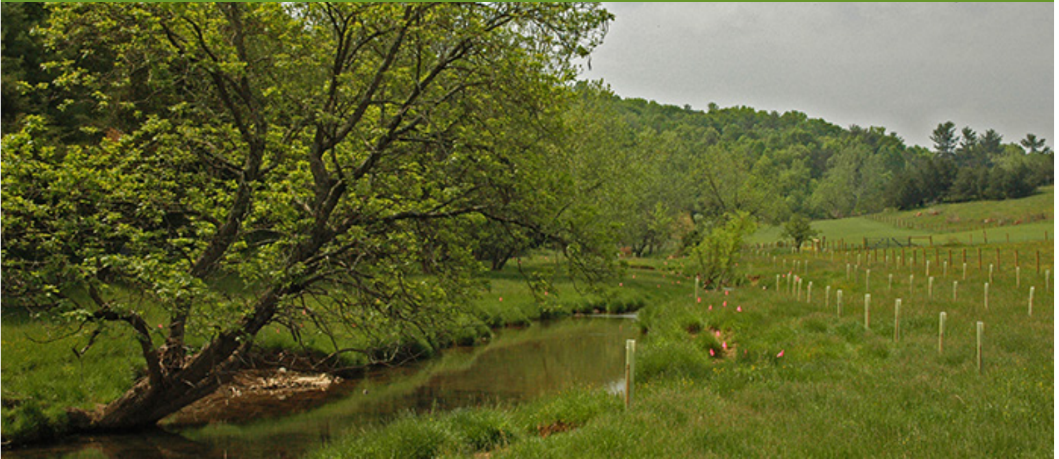
Forested buffers, such as the one that will be created by these new trees, improve water quality by reducing stream bank erosion, filtering runoff, reducing flooding, and more. Photo and caption: Chesapeake Bay Foundation.